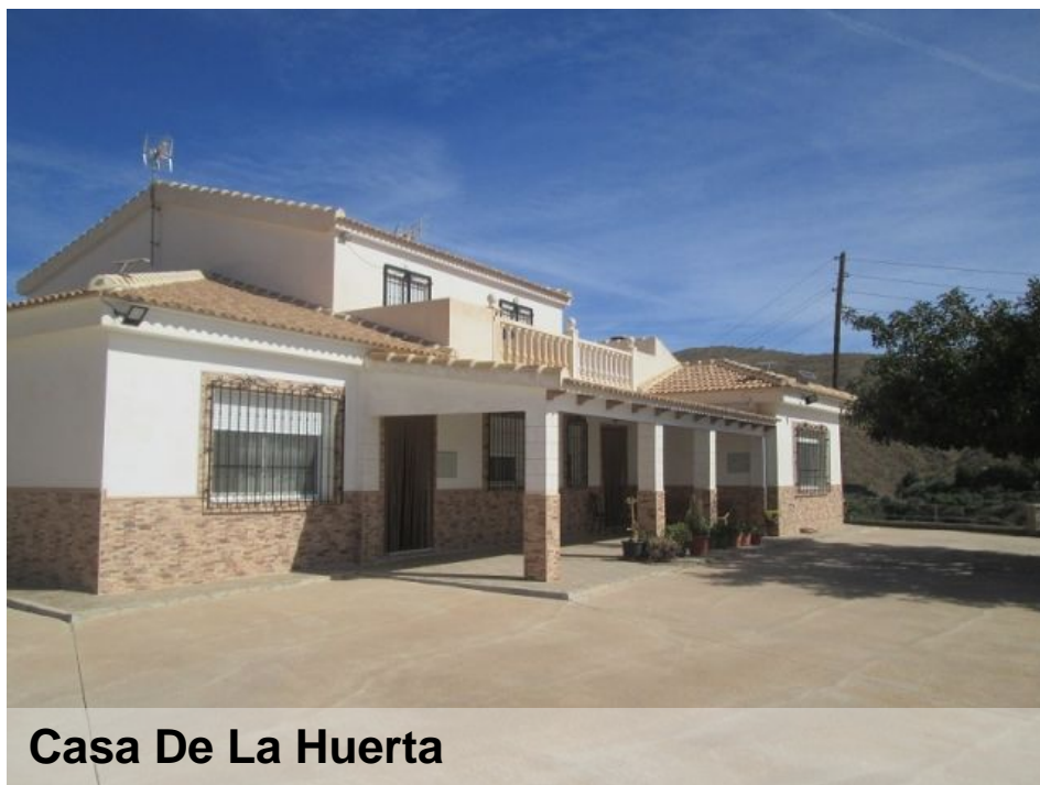
Casa De La Huerta