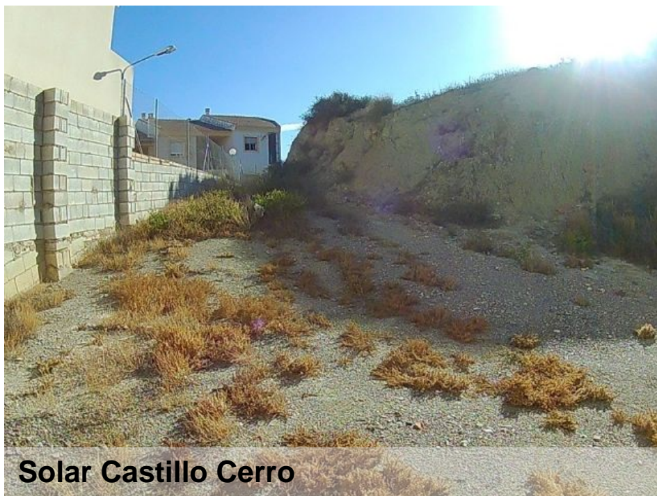
Solar Castillo Cerro